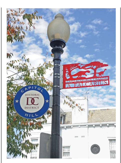
Capitalsaurus Chasing a Falcarius , structural aluminum waterjet cut and then painted with automotive paint, 18 x 32 x .25 inches. Installation view.