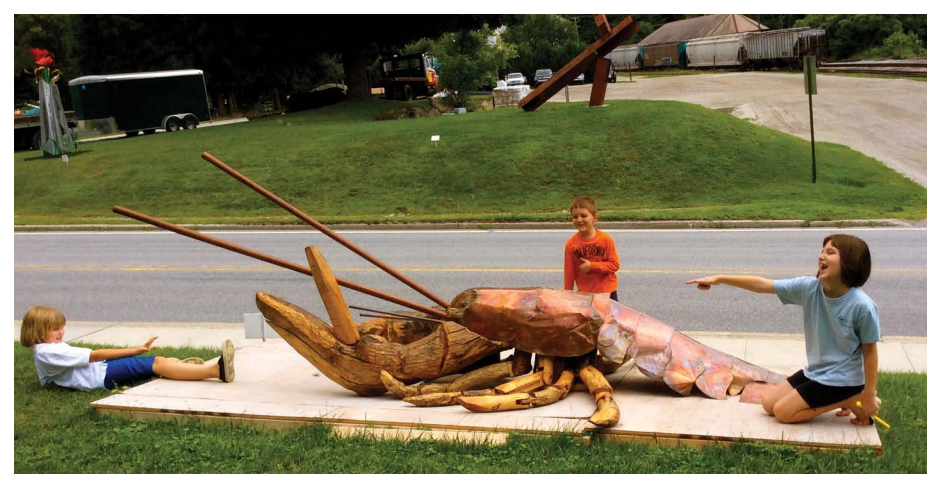
Coppa' Lobsta' , wood and copper, 3 x 12 x 4 feet, draws in young viewers. Installation view at the North Bennington Outdoor Sculpture Show in North Bennington VT.

Today the artist has unleashed his creativity, relishing in a newfound sense of possibility. This is borne out by his unbridled use of materials, where everything from iron to stone to wood is fair game. Even found objects can be imbued with new purpose, as an arched, metal floor lamp in the studio's