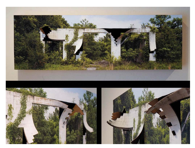
Removal #2 , steel attached to wood frame; steel has been rusted, peeled and has had the photograph attached to the surface, 4 \times 1 feet

Midtown Manhattan Subway Station: Thursday Morning Commute, Late July, stretched canvas, silicon photo transfer, 4 x 8 feet