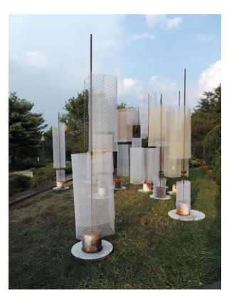
Veronica Szalus, soul of a tributary, concrete, rusted steel, hex netting wire, nylon net fabric, paint, and graphite, 19 sculptural components that spanned 6.5 x 50 x12 feet