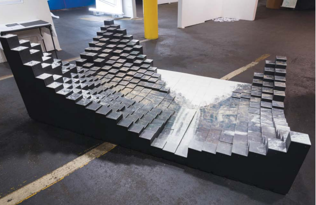
Extrusion #1, wood, masonite and silicon photo transfer, 4 x 10 x 6 feet

squares. The paper squares were then transferred, through his proprietary technique using silicone, to a surface resembling a multilayered chessboard with the squares at different heights. The resulting extruded surface looks like a 3D model of a waterfall, but instead of being hung on the wall, it intentionally lies on the floor.